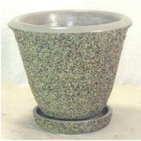
Designer Urn Planter - Concrete 33 "Dia. X 30" High