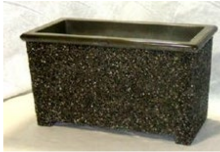
Barrier Planter - Concrete 24" x 72" X 32 H