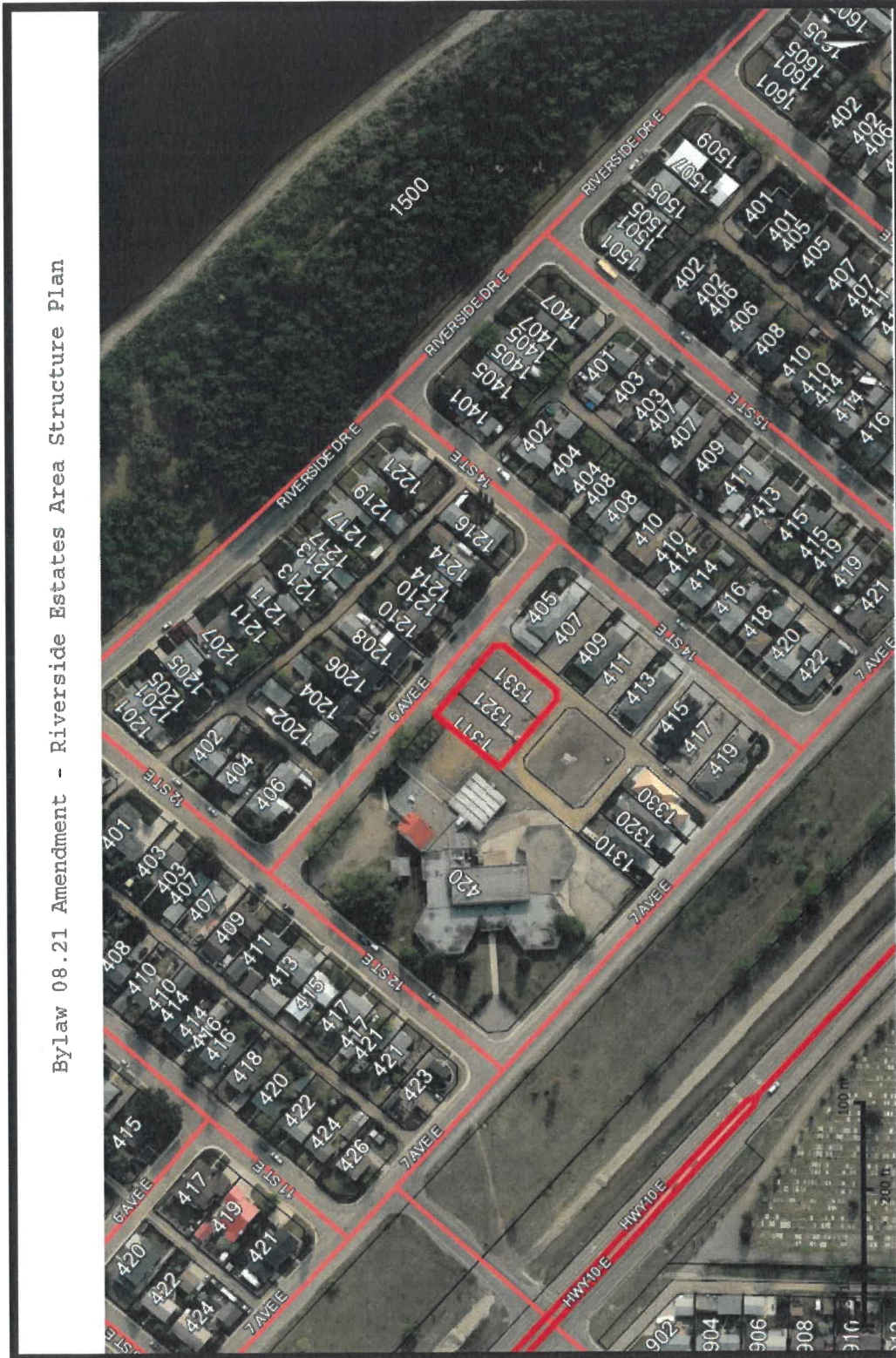
Bylaw 08.21 Amendment - Riverside Estates Area Structure Plan