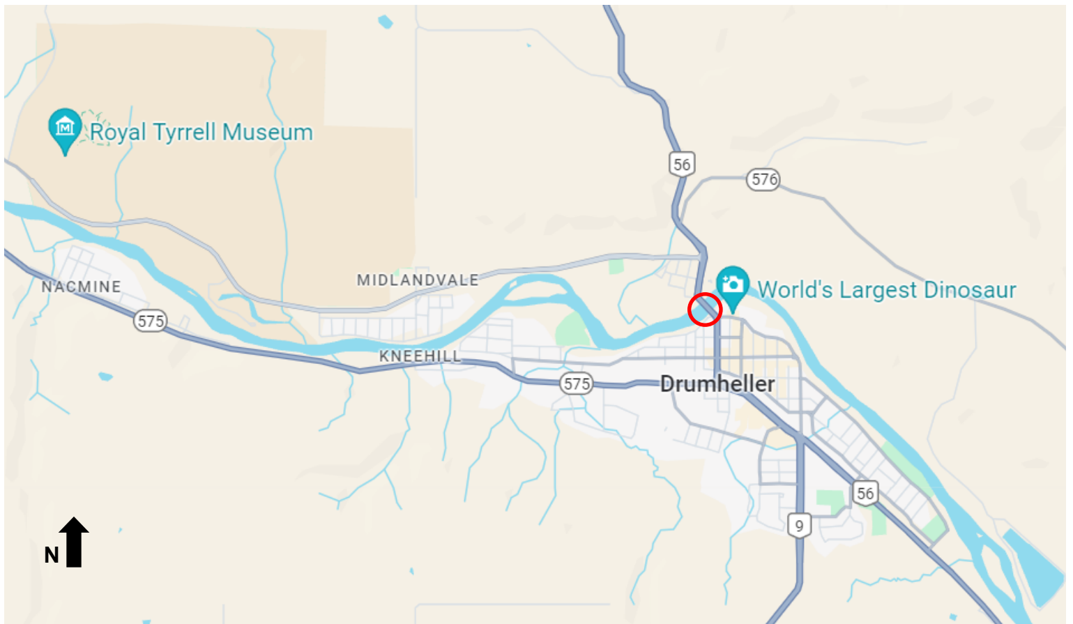
Map. 1 Project location, shown outlined in red.