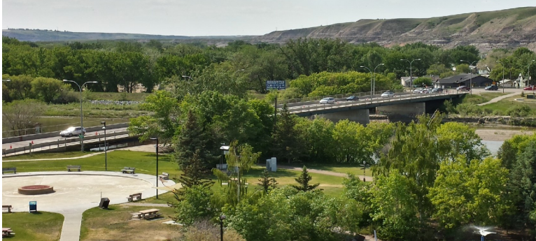
Figure 2. Gordon E. Taylor Bridge, looking North West over the Red Deer River

A traffic accommodation strategy is in place to mitigate the impacts to travelers. This includes additional signage, delineation, and if required, illumination. Please watch for all and obey all construction zone signage. For up to date information on this project, please call 5-1-1 toll free or visit 511.alberta.ca