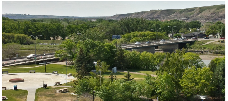
Figure 2. Gordon E. Taylor Bridge, looking North West over the Red Deer River

A traffic accommodation strategy is in place to mitigate the impacts to travelers. This includes additional signage, delineation, and if required, illumination. Please watch for all and obey all construction zone signage. For up to date information on this project, please call 5-1-1 toll free or visit 511.alberta.ca